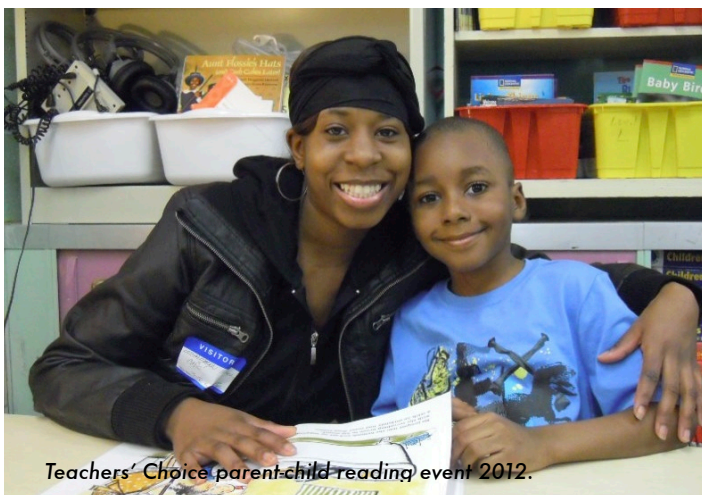
Teachers' Choice parent-child reading event 2012.