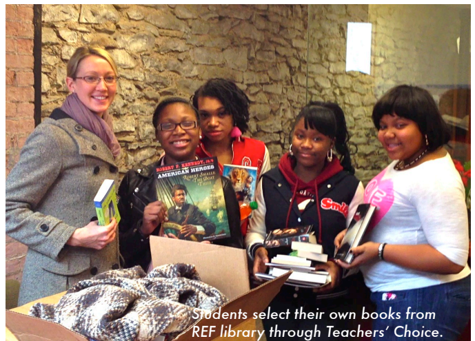
Students select their own books from REF library through Teachers' Choice.